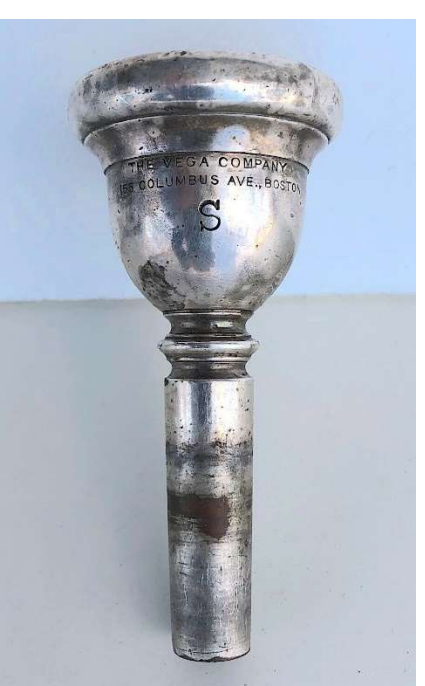
Older tuba model S