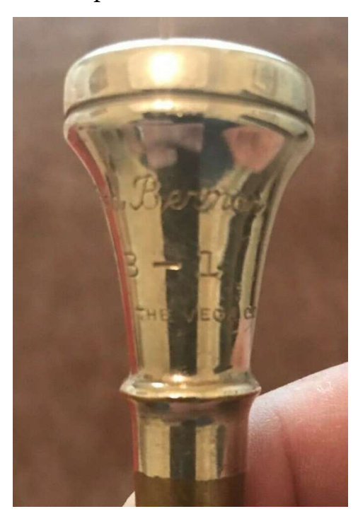
Berman model B-2 trumpet